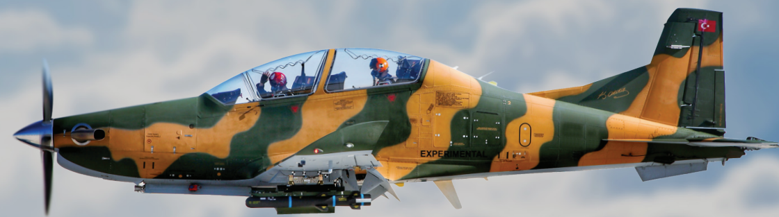
Light Combat Aircraft

Turkish Aerospace Subsidiary of TAFF and an affiliate of SSB